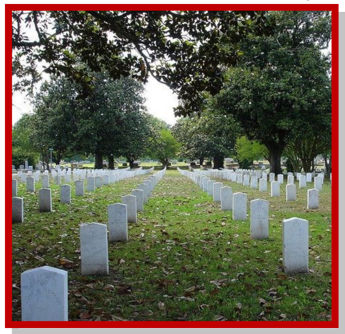
Confederate Graves Friendship Cemetery in Columbus, Mississippi

An article about our Chapter and pictures were sent to UDC Magazine which was printed in the August